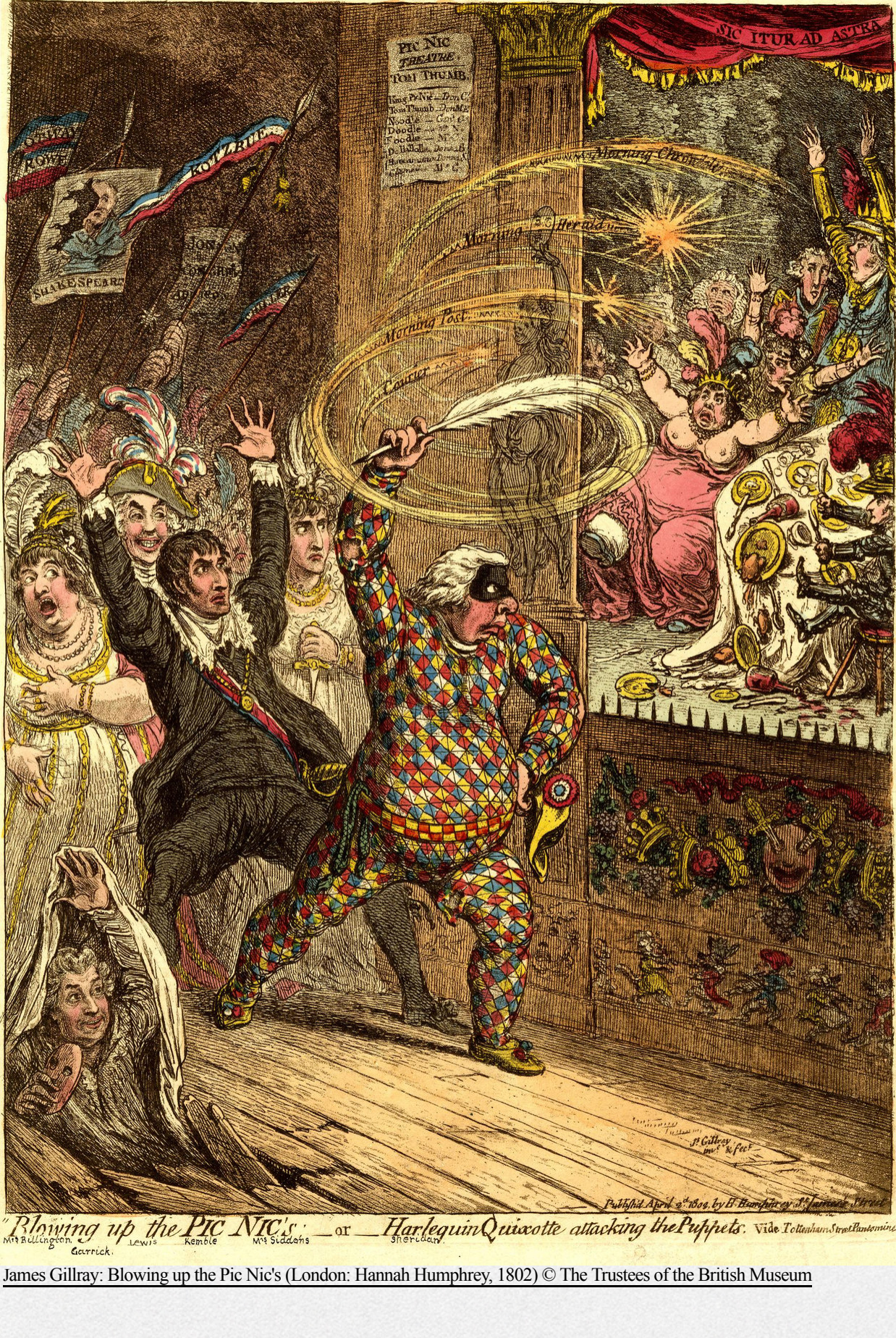
James Gillray: Blowing up the Pic Nic's (London: Hannah Humphrey, 1802)