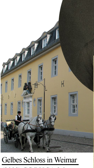
Gelbes Schloss in Weimar (2009)

On the occasion of August von Kotzebue's 260th Anniversary a festive event will take place online on the 3rd of May 2021 starting at 17h CET (Berlin, Paris; 18h St. Petersburg; 18h Tallinn; 16h London; 11h New York; 8h San Francisco). The Kotzebue Picnic aims to bring artists, curators, and academics together in order to celebrate his birthday and to catch up with the flourishing global Kotzebue community.